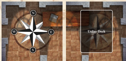
Entrance Hall Squares (red on their reverse side)